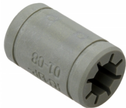
Drylin ball bearing LM10UU €6,69