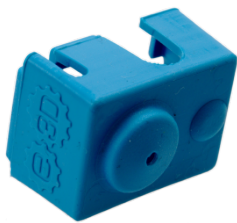
A sock for your E3D HotEnd €4,69