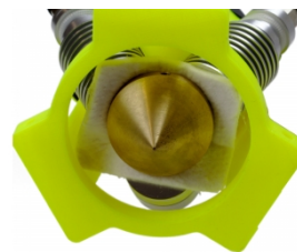
Diamond HotEnd €39,99